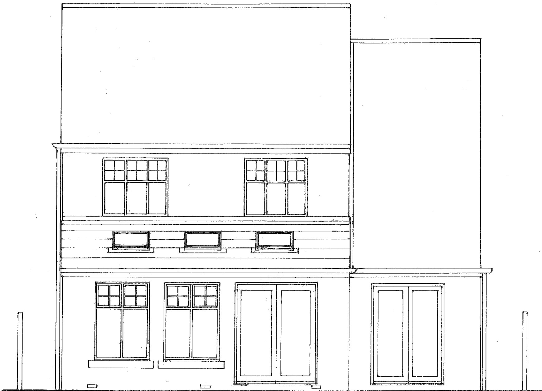
PROPOSED REAR 1:50

PROPOSED EXTENSION TO 16 HIGH TREES, S. SHIELDS FOR MR. & MRS. GRAY DRG NO 1